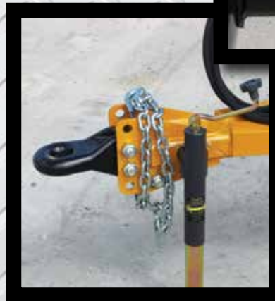
Left: 90° tongue features jack and adjustable clevis.