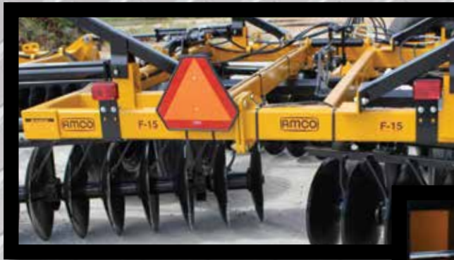
Left: Safety lights, SMV signage, and safety chain are standard.

PRODUCT PERFORMANCE GUARANTEE —Repair, Replace, or Refund: AMCO Guarantees Performance. The best tillage tools deserve the best guarantee. The AMCO guarantee is simple. If, during the first 30 days, your AMCO equipment doesn't perform as promised, and if we don't make it perform in a reasonable amount of time, we'll repair it, replace it, or buy it back.