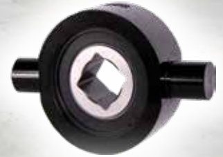
Maintenance-Free Gang Bearings