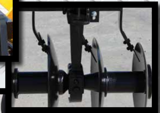
Above: Bearing risers for built-in durability. Standard 22" smooth blades provide clean cutting through soil and residue. Other sizes available.