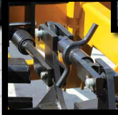
Right: Turnbuckle rod allows adjustments to ensure level cutting. Adapts to various tire sizes and provides level transport.