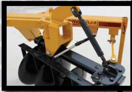
Above: Pictured is the Manual Levee Plow (Hydraulic Levee Plow also available).

Right: Adjustment holes allow the flexibility to build extra narrow or extra wide levees.