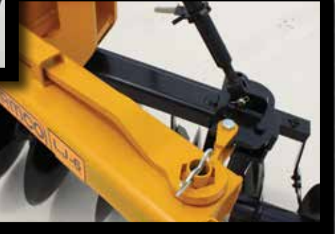
Above: Gang bolt wrench is included.

*To calculate weight/blade, divide the approximate weight of the model by the number of disc blades. Specifications for all models subject to change without notice.