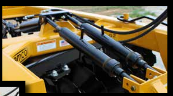
Above: Dual spring stabilizers level unit in changing ground conditions and absorb rough terrain.