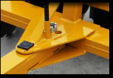
Above: Three tongue settings enable left and right offset positions.