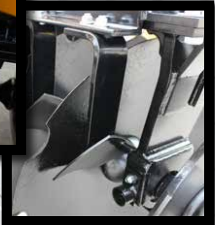
Above: Extreme-duty 5/8" x 3" shanks.