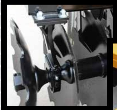
Above: 2 3/4" round-bore greaseable bearings with AMCO's standard 2-year warranty.