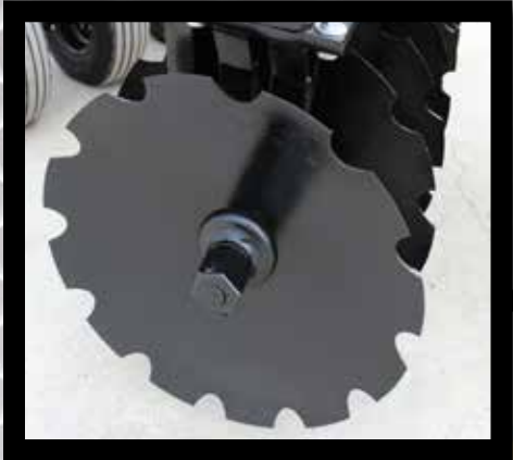
Above: Available with impressive 36" x 1/2" blades featuring 2 1/4" gang axles.

PRODUCT PERFORMANCE GUARANTEE—Repair, Replace, or Refund: AMCO Guarantees Performance. The best tillage tools deserve the best guarantee. The AMCO guarantee is simple. If, during the first 30 days, your AMCO equipment doesn't perform as promised, and if we don't make it perform in a reasonable amount of time, we'll repair it, replace it, or buy it back.