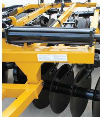
4" x 24" wing-fold cylinders.