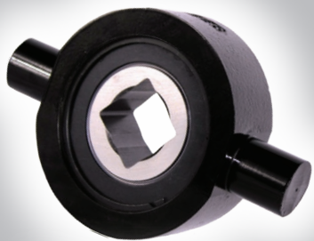
Maintenance-Free Gang Bearings

See reverse for additional disc harrow information.