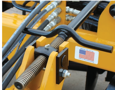
Turnbuckle rod allows adjustments to ensure level cutting. Adapts to various tire sizes and provides level transport.