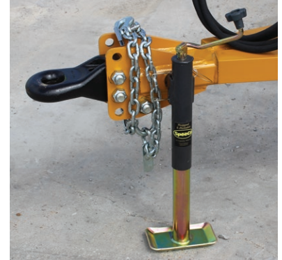
90" tongue features jack and adjustable clevis.