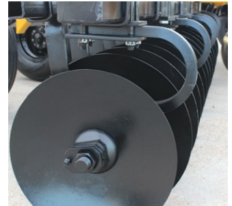
Shock Absorber Bearing Risers (optional).