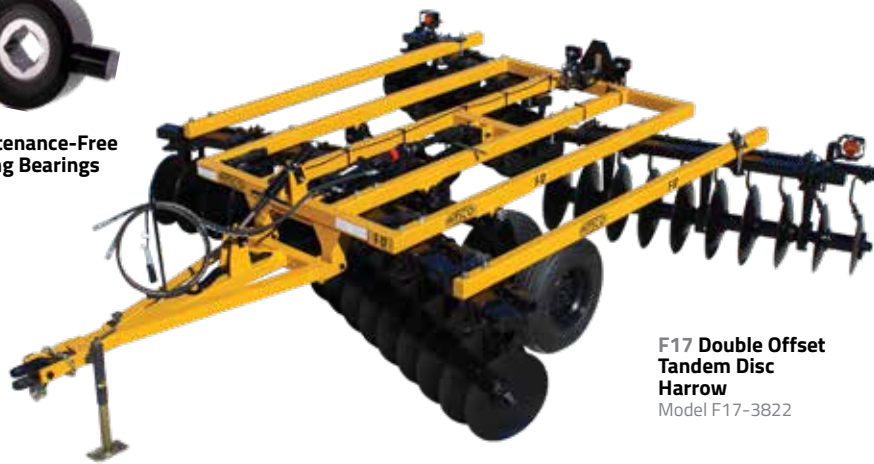
F17 Double Offset Tandem Disc Harrow Model F17-3822