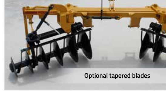
Optional tapered blades