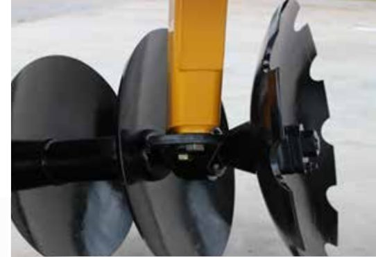
Features cutout blades and diminishing blades