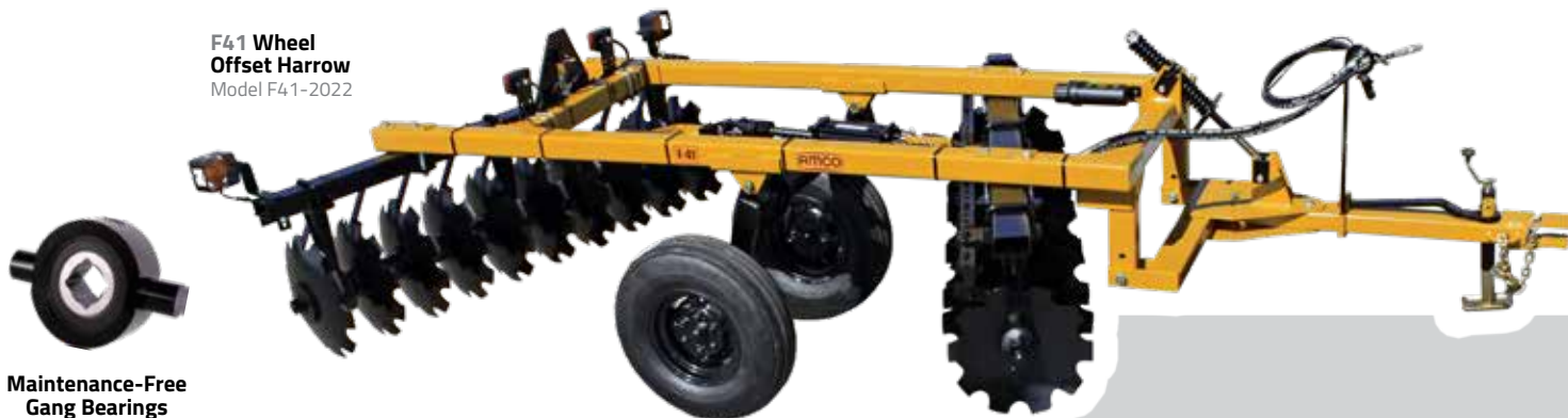
Maintenance-Free Gang Bearings