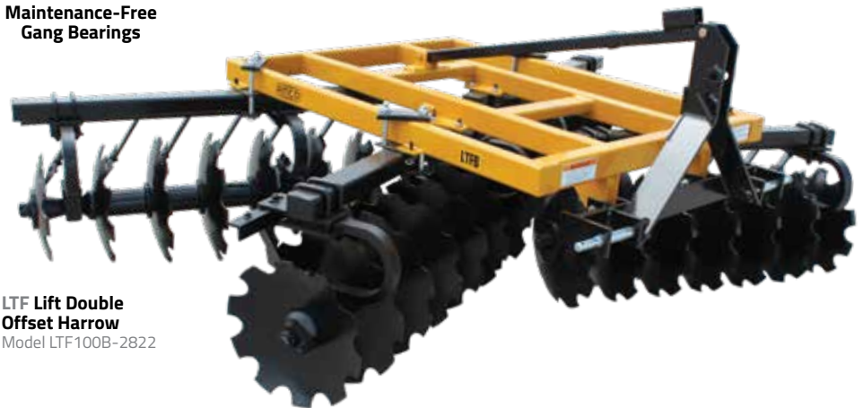
LTF Lift Double Offset Harrow Model LTF100B-2822

The rugged, hardworking LTF Lift Double Offset Harrow is built to make tillage and seedbed preparation go smoothly. It is perfect for maintaining food plots, logging roads, gardens, turn rows, and firebreaks. The LTF is available in six sizes, which means you are guaranteed to find the perfect fit for your operation.