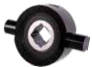
Maintenance-Free Gang Bearings

AMCO has been building the LOF Lift Offset Harrow for almost 70 years. It is designed to build and maintain food plots, logging roads, gardens, turn rows, and firebreaks. The LOF is also ideal for seedbed preparation, pivot turn management, and much more.