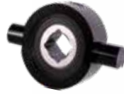
Maintenance-Free Gang Bearings