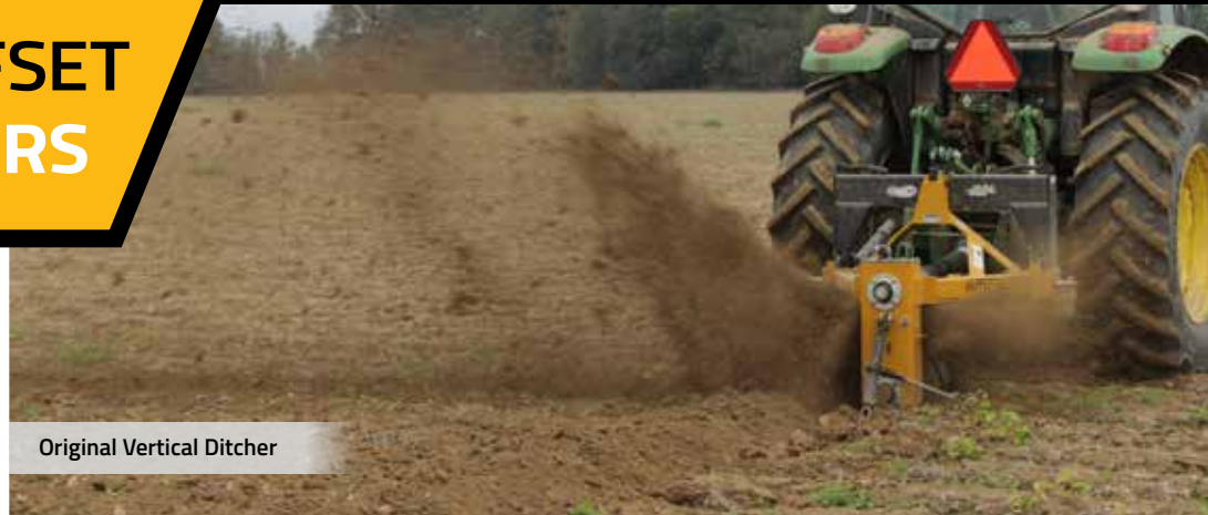
Original Vertical Ditcher