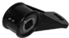
Greaseable Bearings (two bearings per housing)

Our Border Plow is designed to excel in high-residue bedding operations that call for raised beds of different widths. It is also the perfect solution for building borders and levees around your fields.