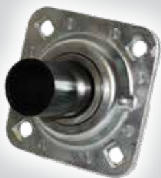
Triple-Lip Sealed Bearings