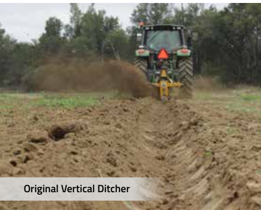
Original Vertical Ditcher