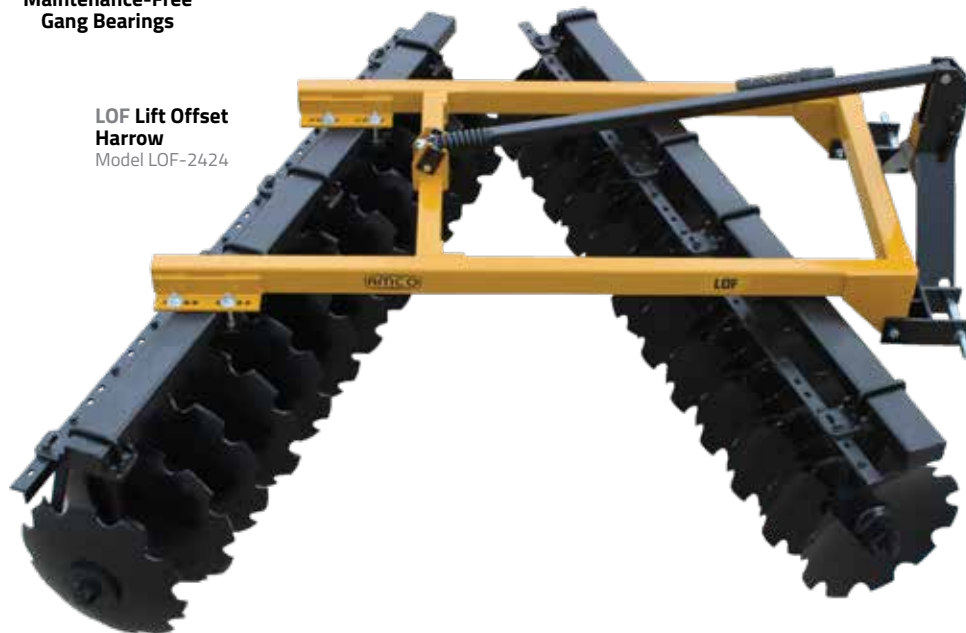
LOF Lift Offset Harrow Model LOF-2424