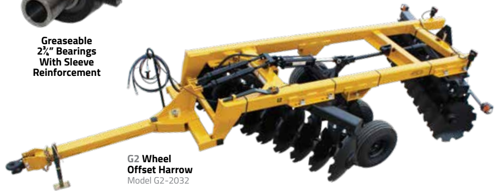
G2 Wheel Offset Harrow Model G2-2032