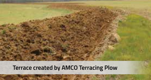
Terrace created by AMCO Terracing Plow