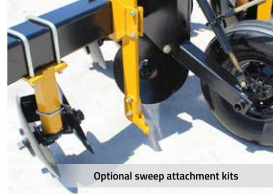
Optional sweep attachment kits