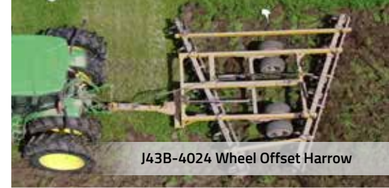
J43B-4024 Wheel Offset Harrow