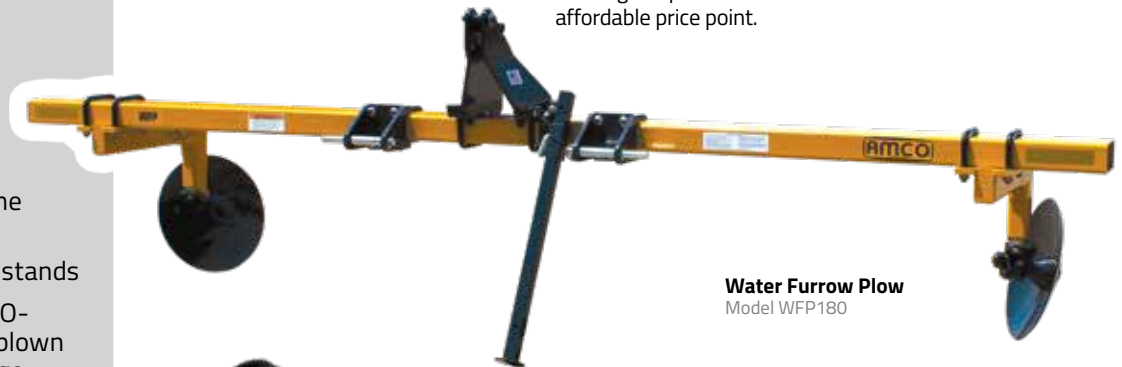
Water Furrow Plow Model WFP180

Standing water prevents you from planting in a timely manner and can lead to yield-robbing delays. AMCO's Water Furrow Plow flips dirt aside so water can drain away, offering the performance of a PTO-driven ditcher at a more affordable price point.