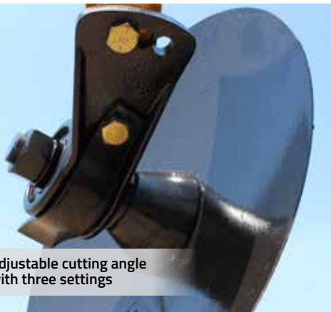
Adjustable cutting angle with three settings

*To calculate weight/blade, divide the approximate weight of the model by the number of disc blades. Specifications subject to change without notice.