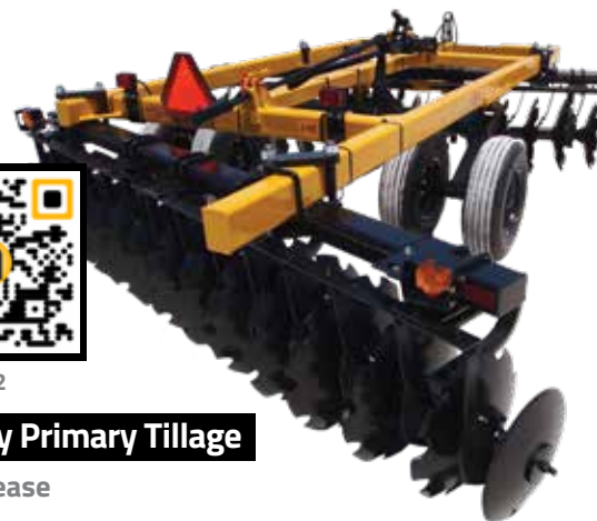
J42 Wheel Offset Harrow Model J42B-2824