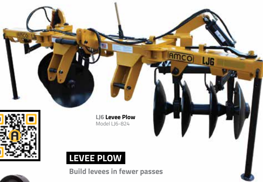
LJ6 Levee Plow Model LJ6-824