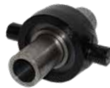
Greaseable 2 1/4" Bearings With Sleeve Reinforcement

The dependable and rugged G2 Wheel Offset Harrow is designed for challenging conditions like breaking new ground and heavily wooded site preparation. It's also built to withstand the toughest construction industry tasks.