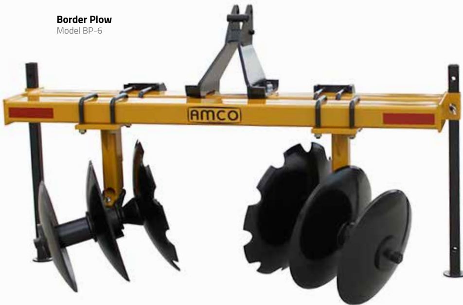
Border Plow Model BP-6