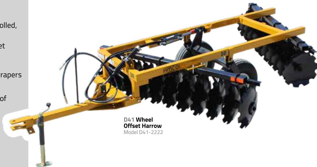
D41 Wheel Offset Harrow Model D41-2222