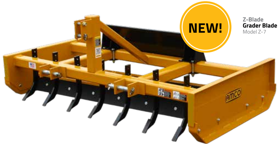
Z-Blade Grader Blade Model Z-7