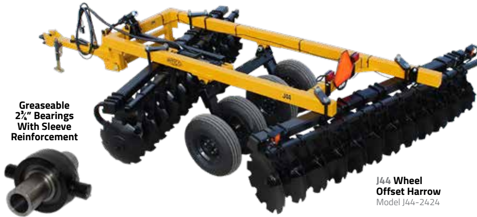
J44 Wheel Offset Harrow Model J44-2424

Greaseable 2 1/2" Bearings With Sleeve Reinforcement